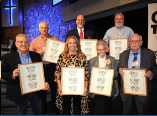
Heart of Jesus Awards: Membership Growth