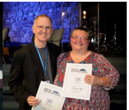
Silver Awards: 25 Years of Ordained Ministry