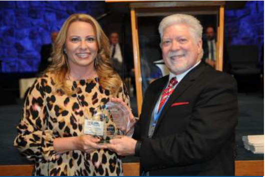
Harvest Leadership Award & Heart of Jesus Leadership Award