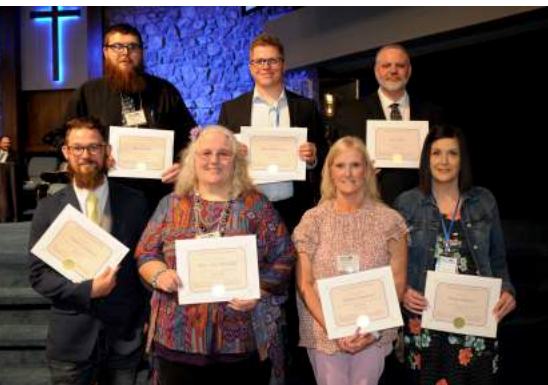
School of Ministry Graduates