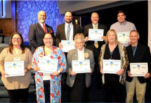
Emerging Leadership Council (ELC) VISTA