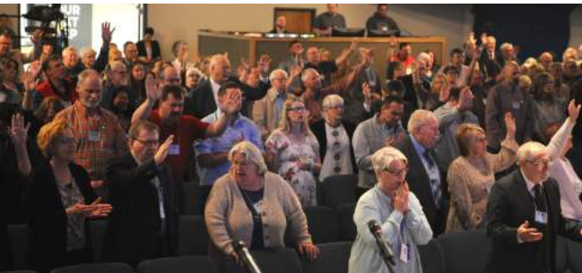
Worship & Prayer at 100th Conference Session