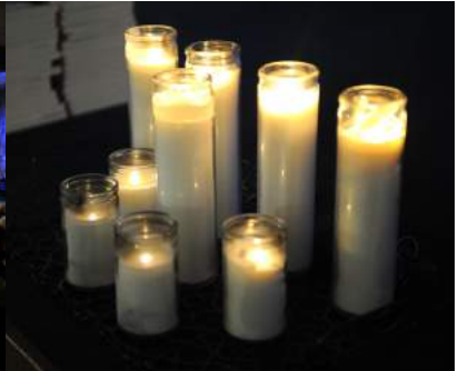
In Memoriam 2022