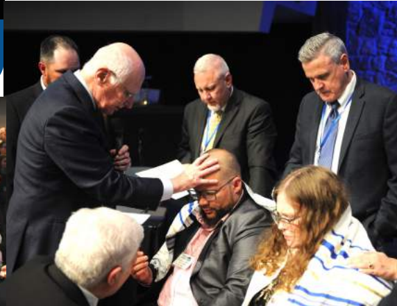
Ordination ceremony and service