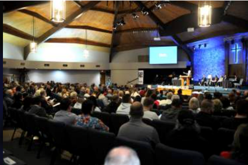
Over 300 in attendance