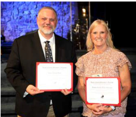
Local Church Minister's License