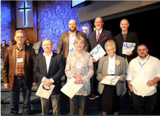
World Missions: Global Impact Awards