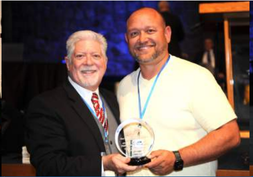
Harvest Leadership Award