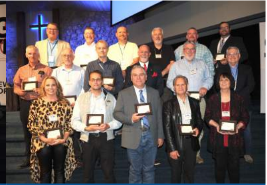
Harvest Awards: Worship Attendance Growth