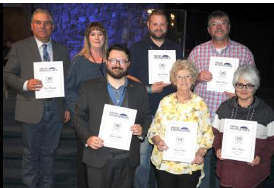
Bronze Awards: 10 Years of Ordained Ministry