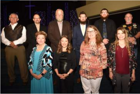
2020 SOM Graduates