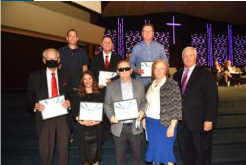
Global Impact Awards