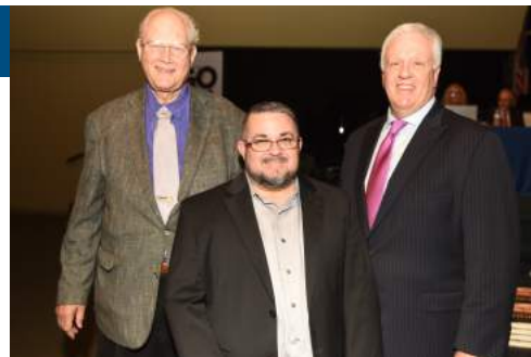
Missions Giving Church of the Year