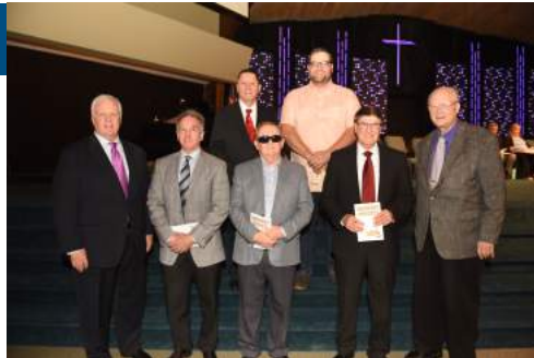
Global Outreach Awards