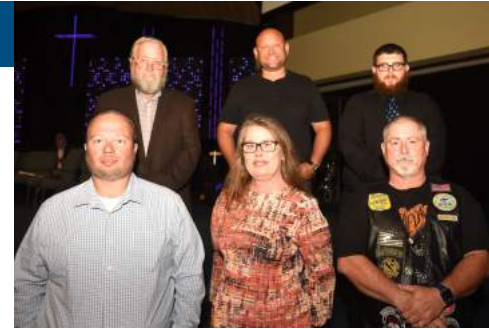
2021 SOM Graduates