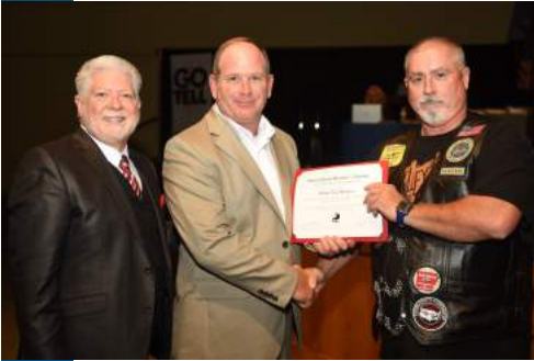
Local Church Minister License