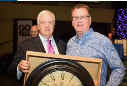
Global Impact Church of the Year